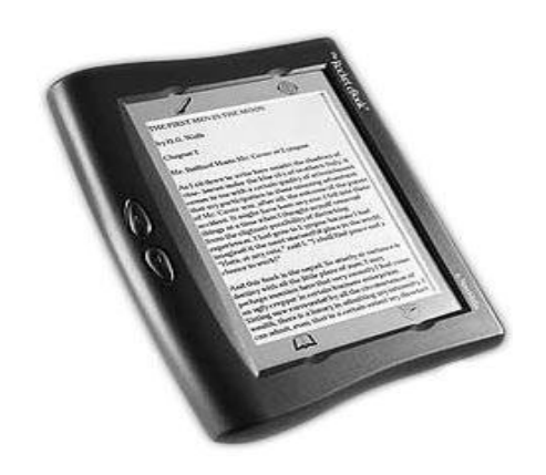
Figure 1.2: Rocket E-books Reader

(Shiratuddin, Landoni, Gibb, & Hassan, 2003, para. 16).