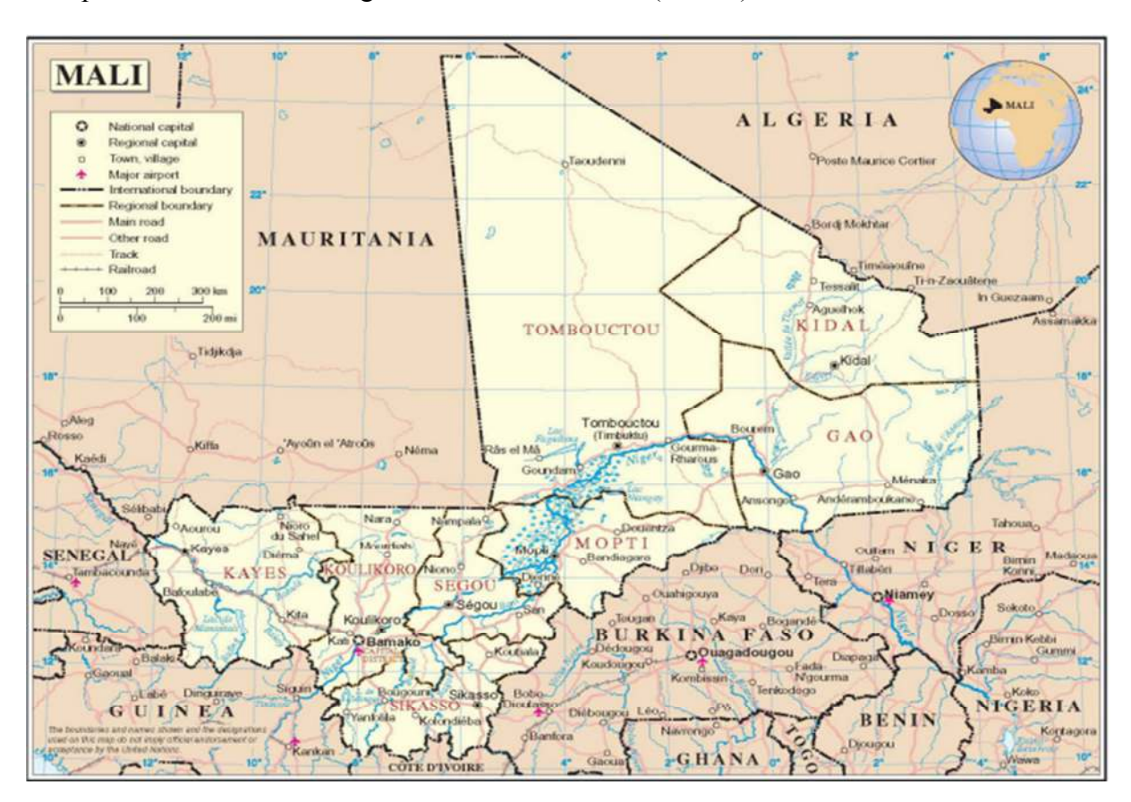
Fig. 1. Map of Mali

In 2013 and 2018, Ibrahim Boubacar Keita won the Malian presidential elections. Apart from security and logistical issues, international observers found the elections to be legitimate. During Keita's second tenure, the country was beset by terrorism, banditry, ethnic-based violence, and extrajudicial military deaths. In August 2020, the military detained Keita, his prime minister, and other senior government officials, forming a military junta known as the National Committee for the People's Salvation (CNSP). The junta formed a transition government in September 2020, appointing Bah N'Daw, a retired army officer and former defence minister, as interim president and Colonel Assimi Goita, the coup leader and CNSP chairman, as interim vice president. The charter of the transition government allows it to reign for up to 18 months before a general election is called ("Mali").